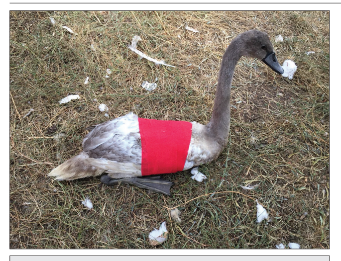
Fig 3. Bandage application of the swans were bandaged adjacent to their bodies for one week