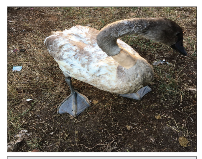
Fig 4. Case No. 1 after the bandage is removed, on the 7^{\text{th}} day of treatment

However, the progression of the problem was stopped by the regulation of the ration. Among all the affected birds, clinical improvement was seen in 4 white swans as compared to 2 black swans with no improvement. The partial and complete wing amputation is recommended for these two cases. But it was not accepted.