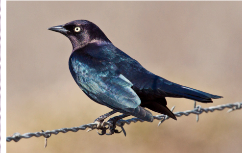
Male Brewer's Blackbirds are inkier and more iridescent black than male Rusties. Females have dark eyes with drab brown plumage.