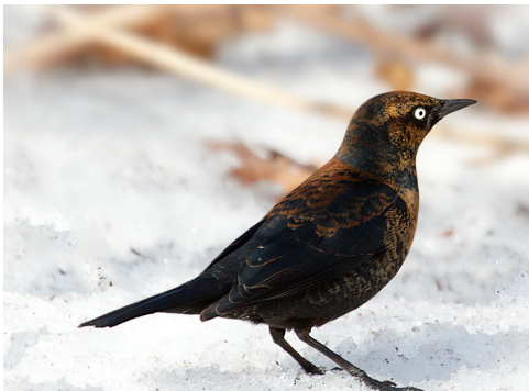
Male in winter plumage.