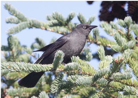
Female in summer plumage.