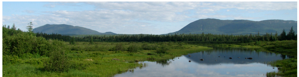
Boreal wetland breeding habitat.