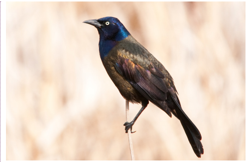
Common Grackles have thicker bills and longer, more graduated tails than Rusties. Both sexes have iridescent plumage.