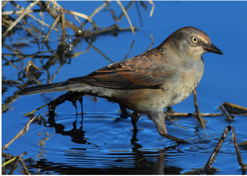
Female in winter plumage.