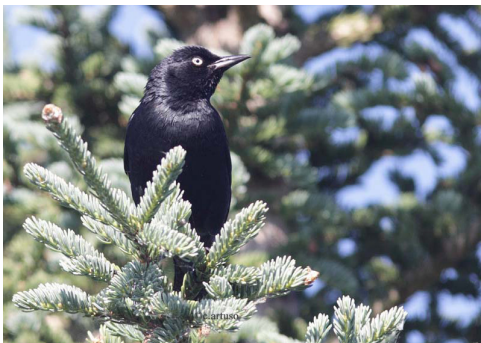
Male in summer plumage.